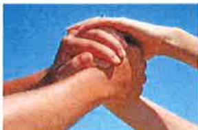
Using a team approach to create a safer and healthier community.

The mission of the Fremont and Chaffee County DUI Court is to increase public safety by providing judicially-supervised and meaningful alcohol treatment and accountability of repeat DUI offenders, to change offenders' behaviors to become more productive, and to decrease recidivism and law enforcement costs.