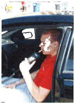
Stay Sober, Stay Safe

There are five phases to the DUI Court program. The goal is for participants to complete the program in 18 months.